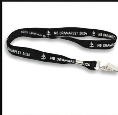
LANYARDS - $2