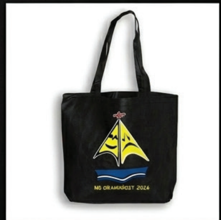
TOTE BAGS - $15