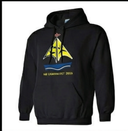
HOODIES - $50