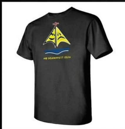
T-SHIRTS - $20