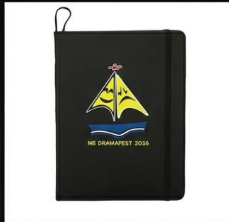
NOTEBOOKS - $5