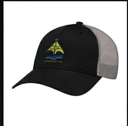
HATS - $25